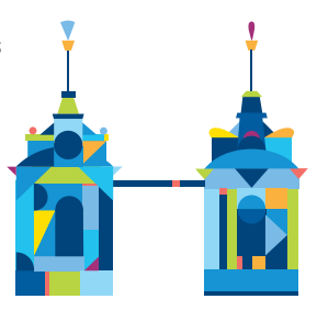
Press Office UW © 2017